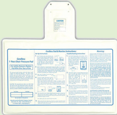
Chair Pad (380mm x 255mm) - FPC1-2661

All pads supplied with a wireless transmitter and have a guaranteed life expectancy of 12 months, when used in accordance with manufacturer's instructions.