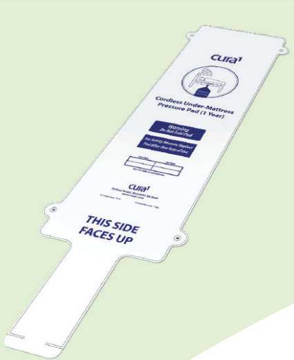
Under Mattress Pad (800mm x 290mm) - FPC1-3517