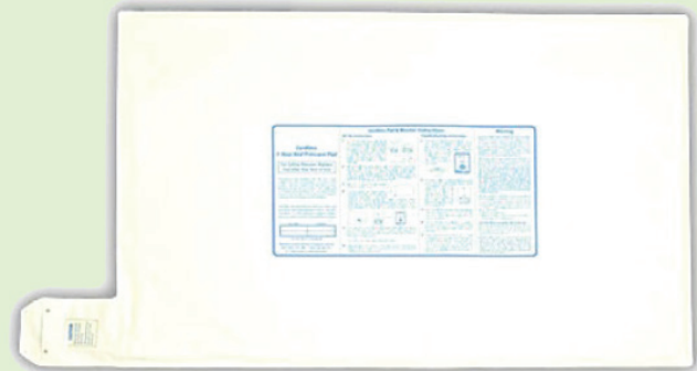
Bed Pad (760mm x 510mm) - FPC1-2662