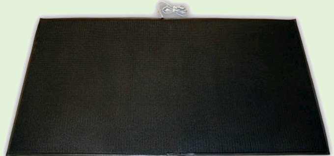
Cura1 Premium Heavy Duty Non-Slip Floor Mat