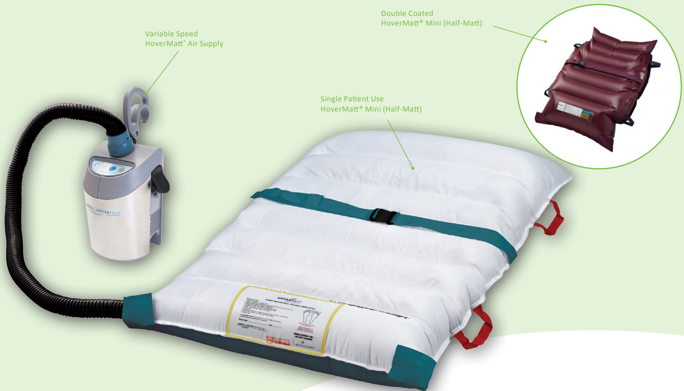
Variable Speed HoverMatt® Air Supply

The HoverMatt® Mini (Half-Matt) delivers the same effortless lateral transfers and positioning as the standard HoverMatt® Air Transfer System, but in a shorter length. Specifically designed for use in the O.R. with specialty tables as well as in Labour and Delivery, the Mini is available in both reusable and single-patient use models. The reusable Mini with a double-coated finish is often preferred when excessive fluids make stain resistance a priority.